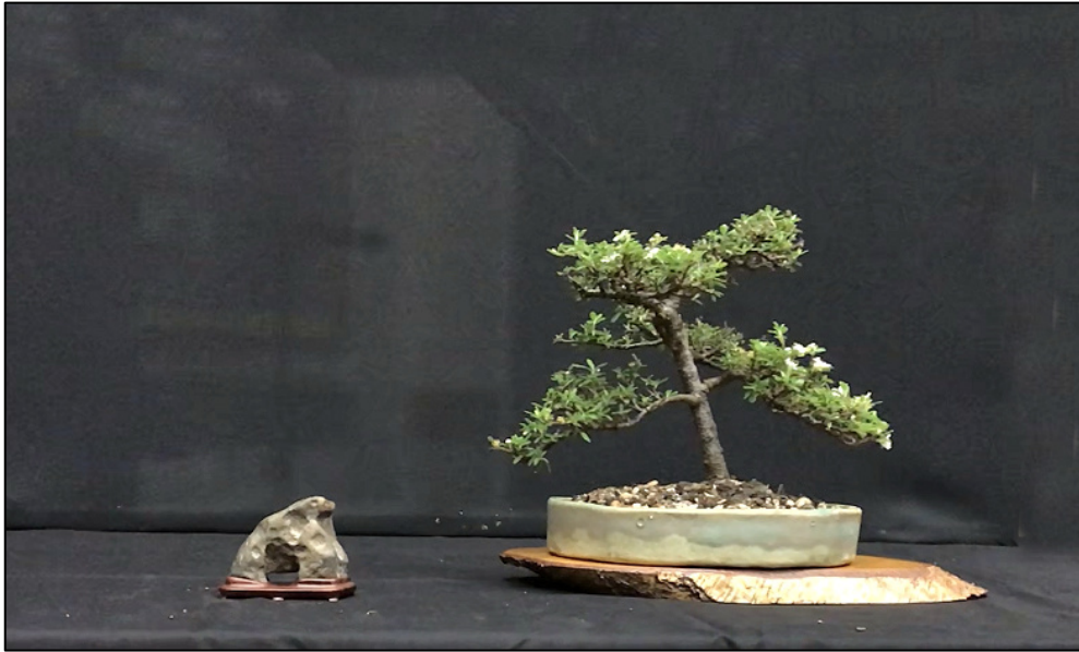
John C's Cotoneaster

Next up for discussion was a Cotoneaster, on a wooden slab and accompanied by a Chinese Money plant accent. The accent was very nice but too big for the display so John replaced it with a small stone on a carved stand. Next John tried turning the wooden slab over, as both the tree and the slab were flowing in the same direction. After some reflection, John decided to replace the slab with a low table. As you can see in the picture below, the composition is now much more harmonious.