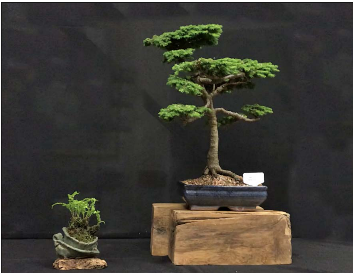
The finished display

First suggestion from John was "if you are going to use blocks like that, then either use them singly or place them asymmetrically". To accompany this tree, you will need a chunky accent and stand. A delicate accent or stand would be overshadowed by the visual weight of the tree and blocks. So, John chose a Fern in a modern pot and placed it on a thick wooden slab with a natural edge, to complement the Elm blocks.