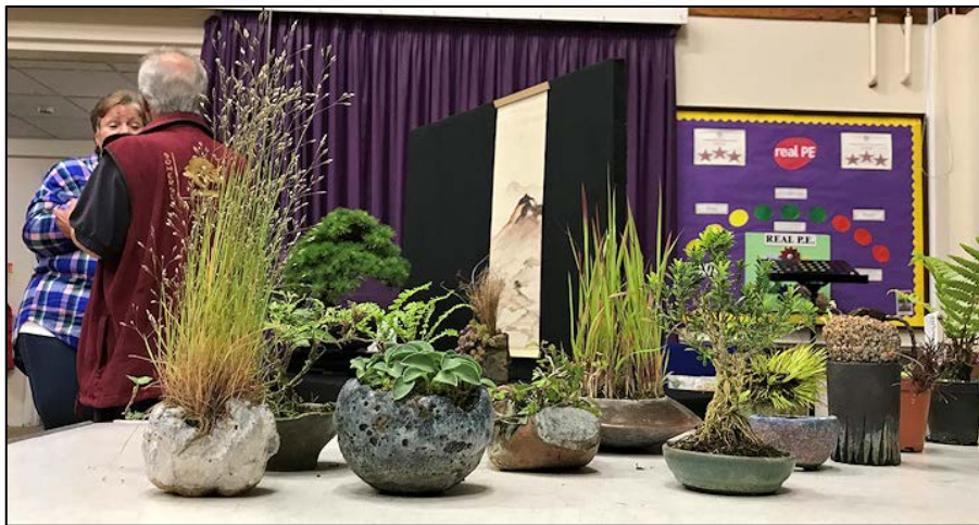
A selection of accent plants from John's collection.

So, are we all agreed that a bonsai looks better on its own? I still hear some grumbles but I will ignore them. If that is true, then how about placing the bonsai on a suitable table, mat or wooden slab? If that looks better then why don't we add an accent plant or a stone/a bronze or a suitable scroll? Oh look, now we have something that looks like a bonsai being displayed at a show – nice!