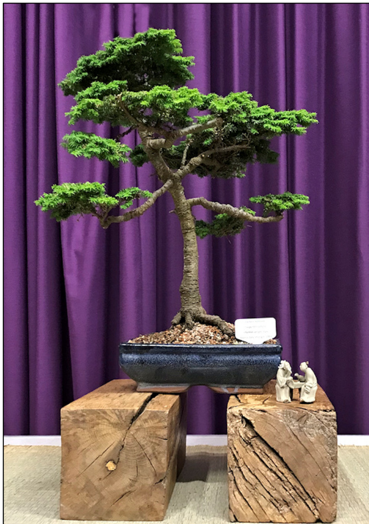
Nigel's Eastern Hemlock