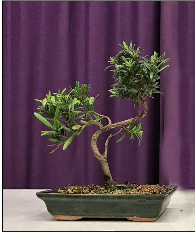
A Mystery Podocarpus!