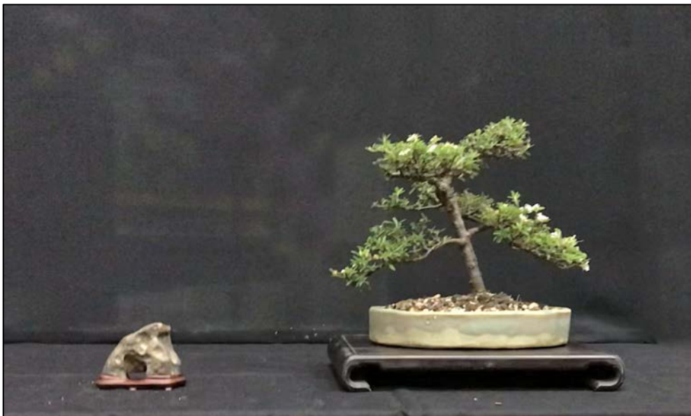
Again, a simple composition but it looks right.

Next up for discussion was a Cotoneaster, on a wooden slab and accompanied by a Chinese Money plant accent. The accent was very nice but too big for the display so John replaced it with a small stone on a carved stand. Next John tried turning the wooden slab over, as both the tree and the slab were flowing in the same direction. After some reflection, John decided to replace the slab with a low table. As you can see in the picture below, the composition is now much more harmonious.