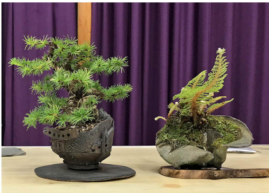
A shohin Larch and a Fern, both in contemporary style pots

mosses to cover most of the surface. Not all of it. Leave space around the edge of the pot and around the nebari. This is something that really needs to be done a couple of weeks before the show in order for the moss to bed in. I usually secure the moss to the surface with fine bonsai wire bent into u shaped staples. Keep the moss watered and away from birds etc. John commented that at European shows you often see trees with lots of different types of moss covering the surface in little round tussocks. John is not a fan of this style and prefers to use similar types of mosses and lichens for a more natural look. John then referred us to a tree that he had brought along, the Siberian elm that is shown at the start of this report. This tree has been prepared for a show, which will happen in a few days. John has had this tree in his workshop for the last week, under grow lights to provide uniform light for the leaves. The branches have been pruned and the trunk has been cleaned. The pot has been washed and given a polish with leaf shine and the surface has been cleaned/weeded and the moss has had anything that is not "moss" removed; insects, weeds, dead leaves etc. The final step will be placing a layer of fine Akadama around the edge of the pot, probably on the day of the show to prevent any loss during watering and transport. John explained that you can use Camelia oil on your pots but that the leaf shine helps prevent lime scale build up.