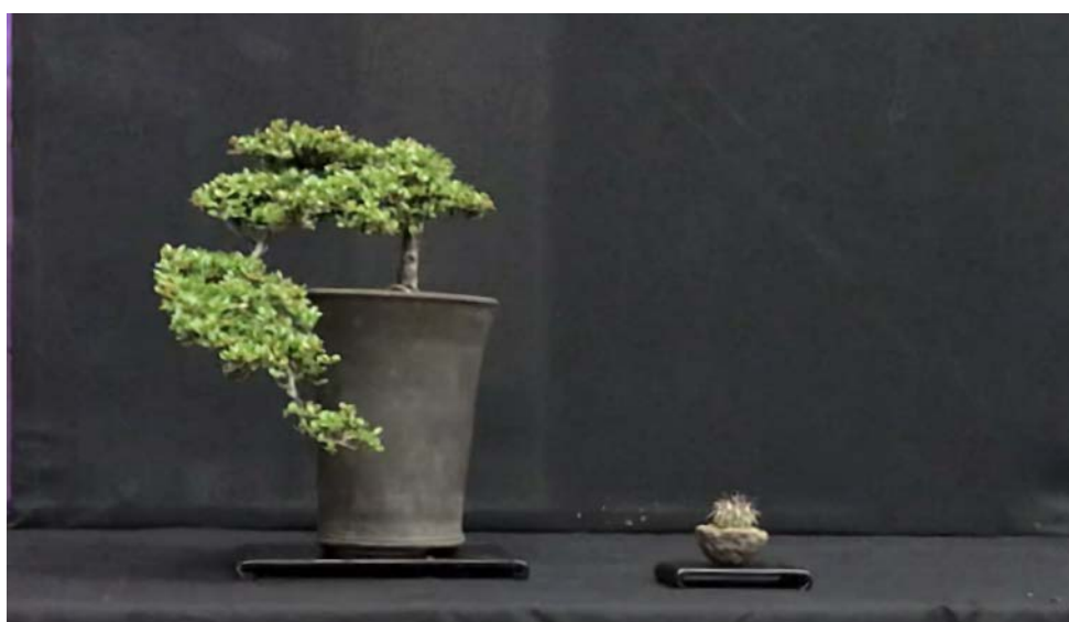
The finished display, simple and understated

This is an interesting tree to display. Does it flow to the left or the right? After some thought, John decided that this tree flows to the right, so the accent needs to be placed on the right. What do you think about the stand? It is a lovely stand however it looks a bit overpowering for this tree/pot. A darker stand would look better, so John chose a low black table with scroll ends to complement the pot. You could also use a taller stand that is a similar width to the pot or a flat Jitta/bamboo mat that is the same length as the height of the tree/pot. One other idea was to use a longer jitta and place the accent on it, linking the tree and accent into one display.